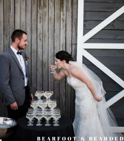
BEARFOOT & BEARDED