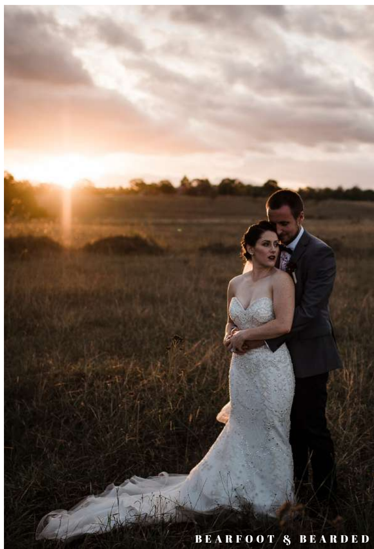
BEARFOOT & BEARDED